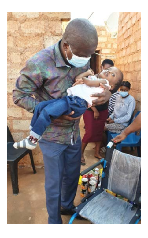
The Mayor Holding the Boy

Mokgethoa family were very emotional and happy at the gesture shown by the Municipality to enable the young man to be mobile and able to play with other kids.